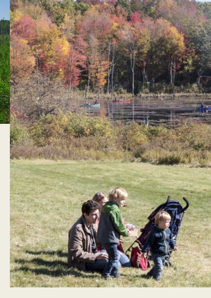
Farm Pond Wildlife Pond

You may visit a wetland and get to know some of the special plants and animals that live there.