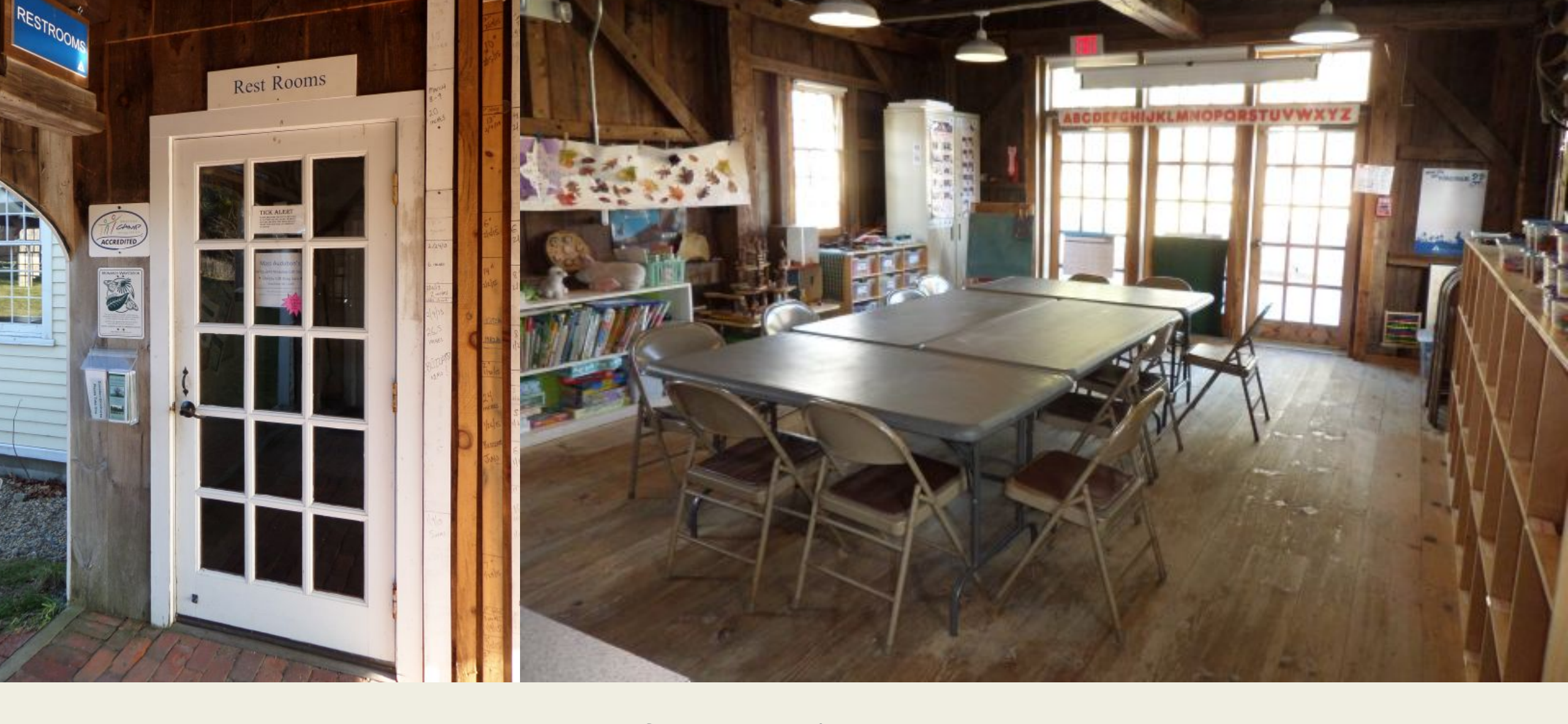
Bathrooms, a water fountain, and the program room are off the breezeway – look for the signs.